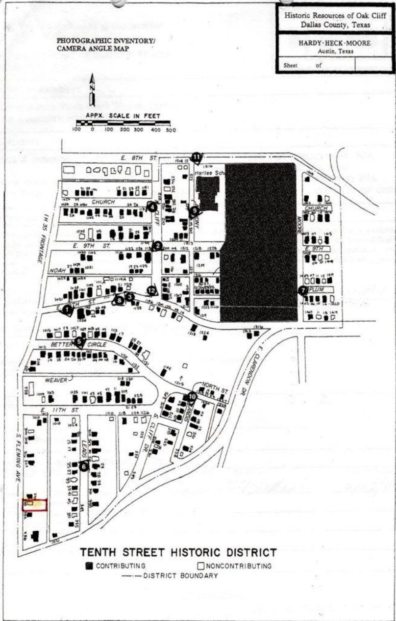
Figure 02 Hardy Heck Moore- 1994

"You miss 100% of the shots you don't take." Wayne Greatsky