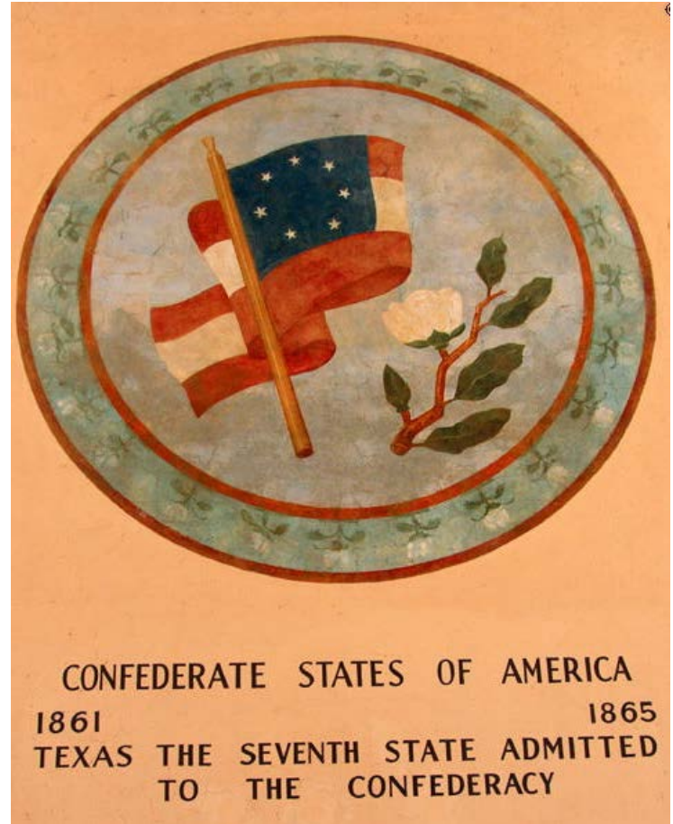
Confederate Roundel , 1936