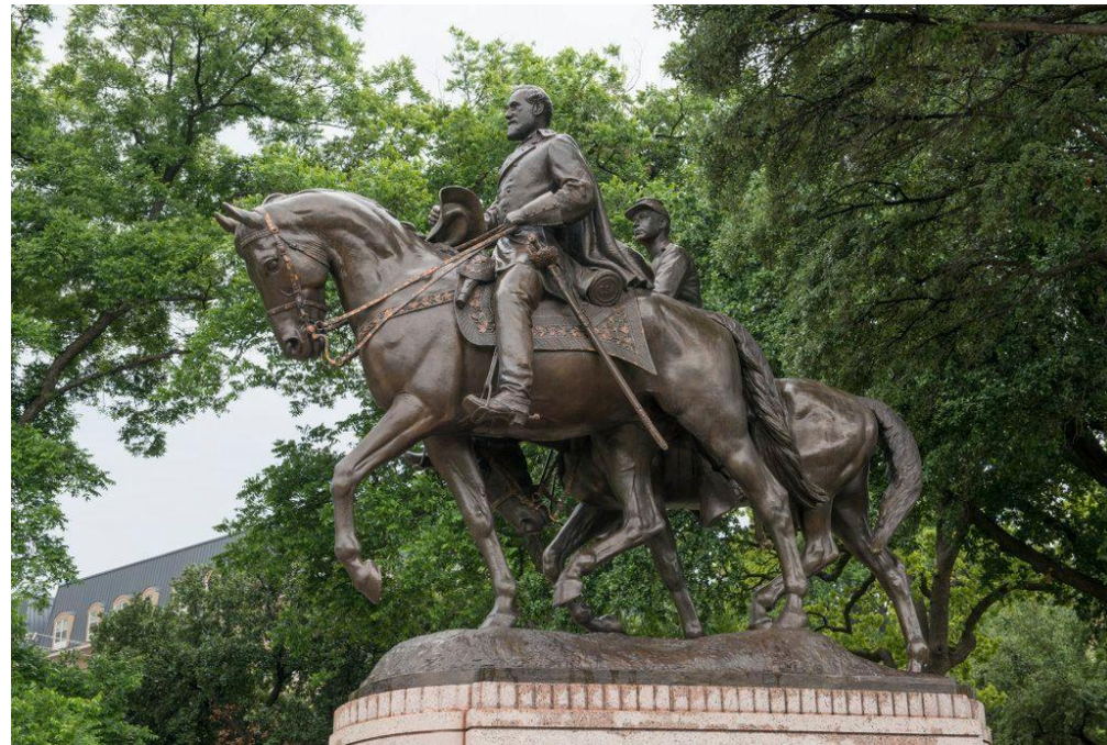
Alexander Phimister Proctor, Robert E. Lee and the Confederate Soldier , 1936