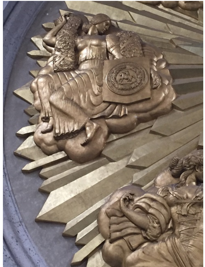
Detail of the Confederacy figure –right