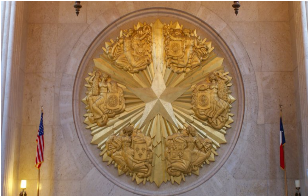
Joseph Renie, The Great Seal of Texas , 1936