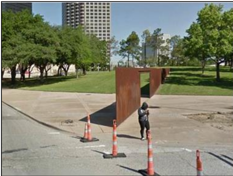
Cor-ten material as sculpture John Carpenter Plaza - 2201 Pacific