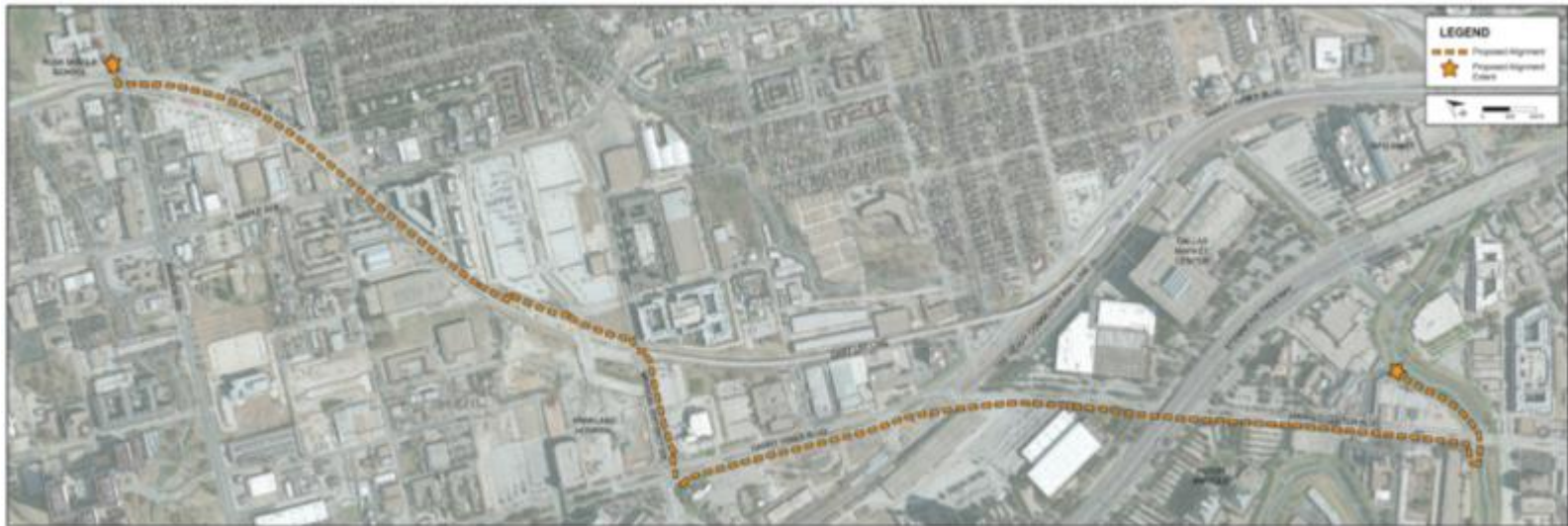
Trinity Strand Trail Phase II - Scope Graphic