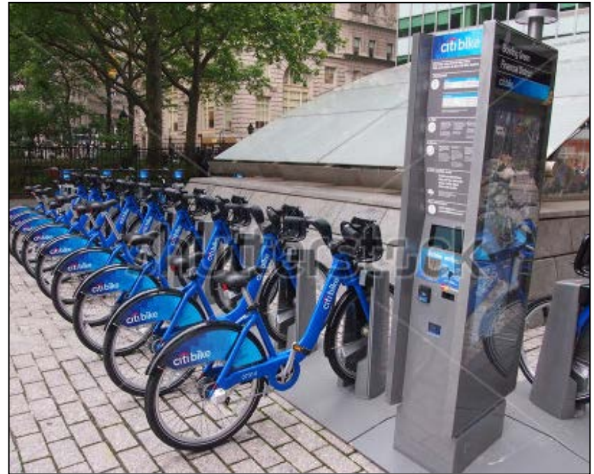
Citi Bike: New York City