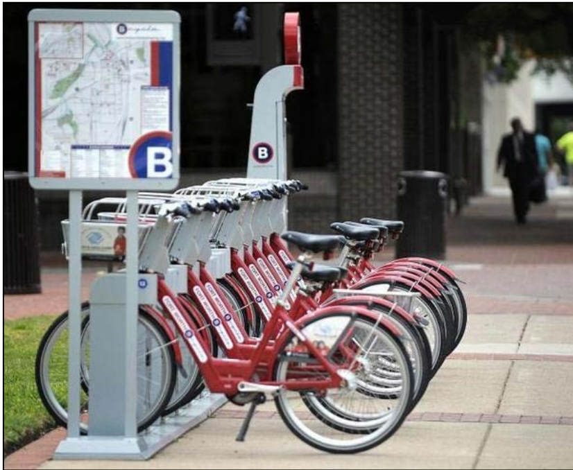
Bicycle: Fort Worth