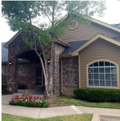
Parks At Cliff Creek