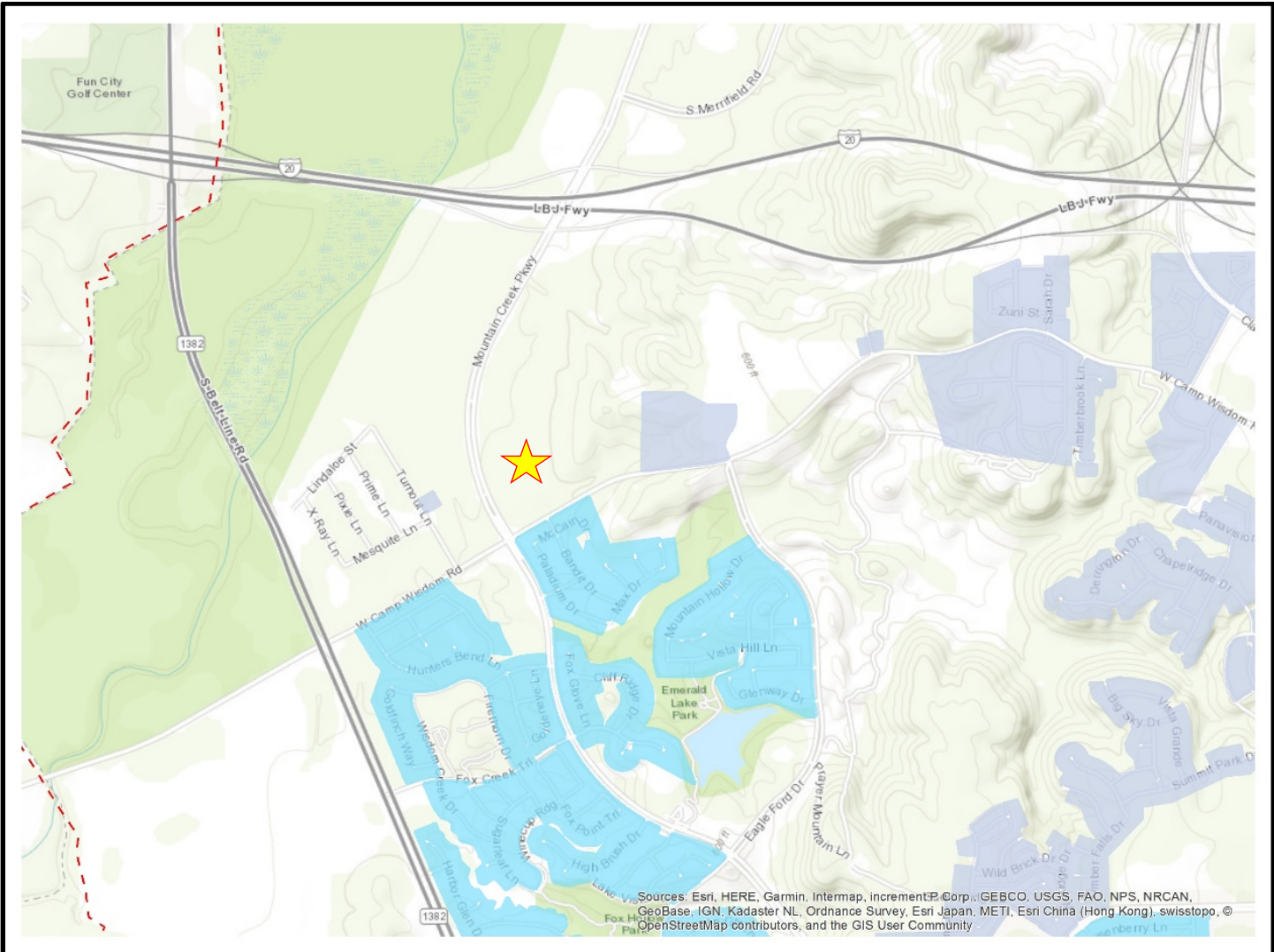
Exhibit G Market Value Analysis