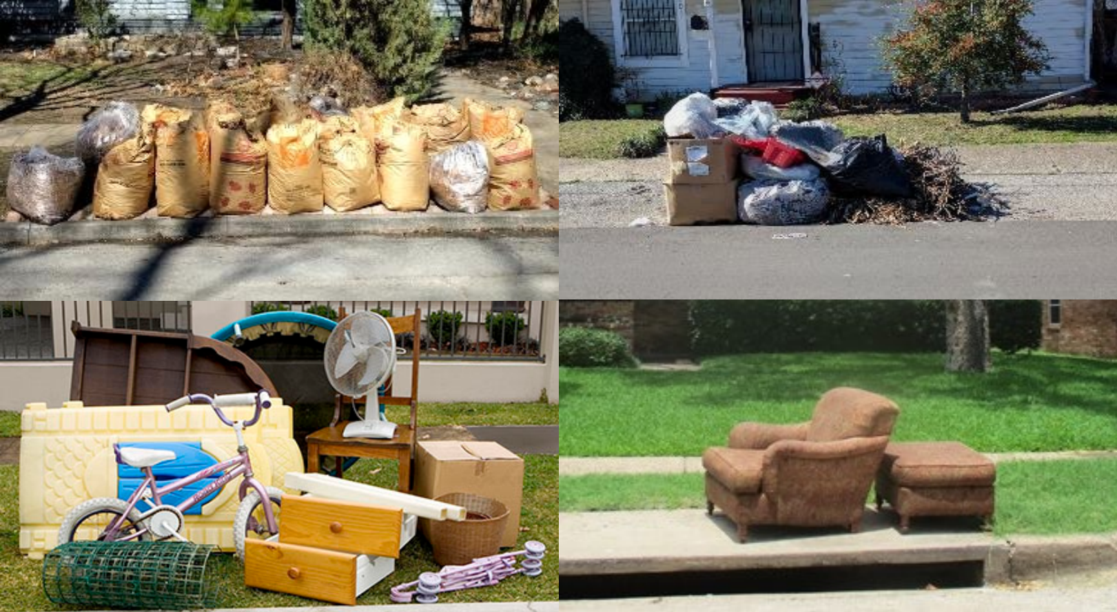
OKC.gov – Bulk Waste