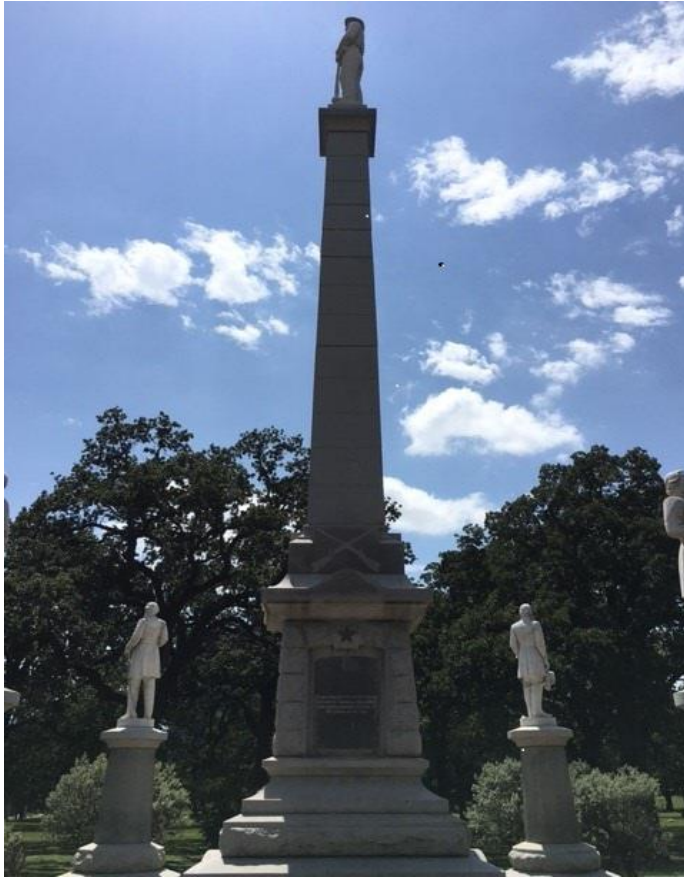
Frank Teich, Confederate Monument , 1896-97