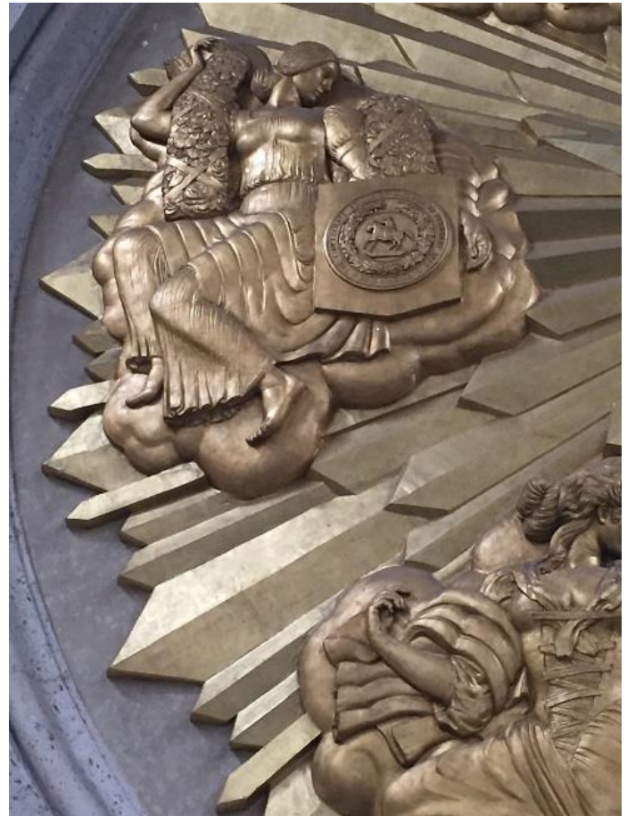
Detail of the Confederacy figure –right