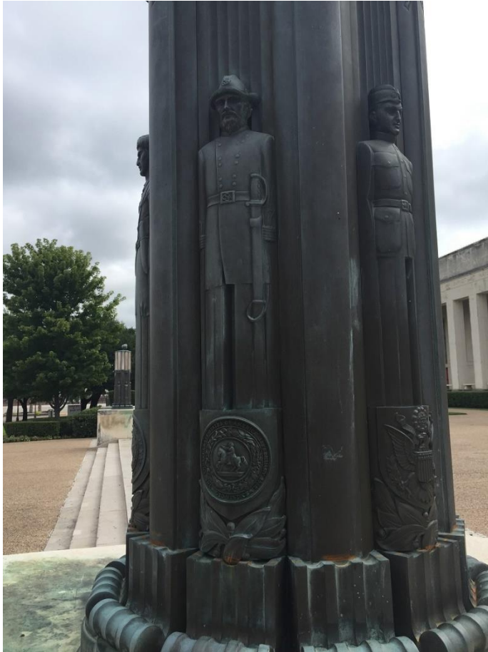
The Confederate Soldier, 1936