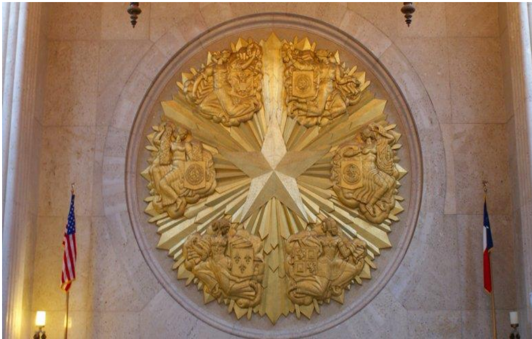
Joseph Renie, The Great Seal of Texas , 1936