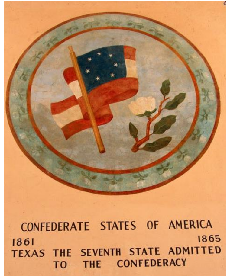
Confederate Roundel , 1936