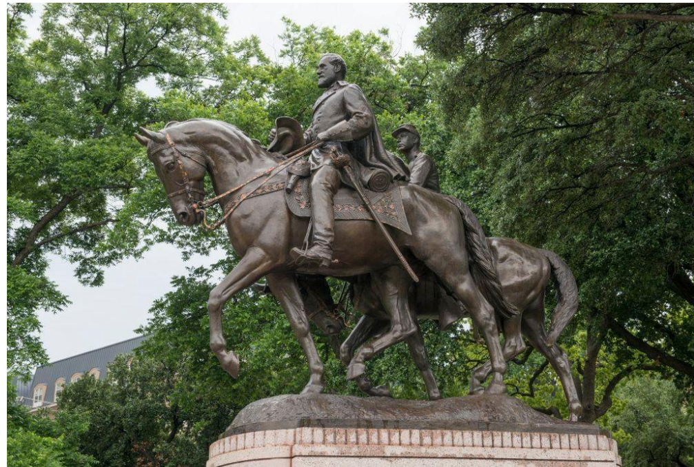
Alexander Phimister Proctor, Robert E. Lee and the Confederate Soldier , 1936