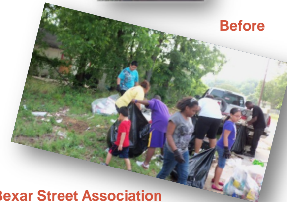
Bexar Street Association