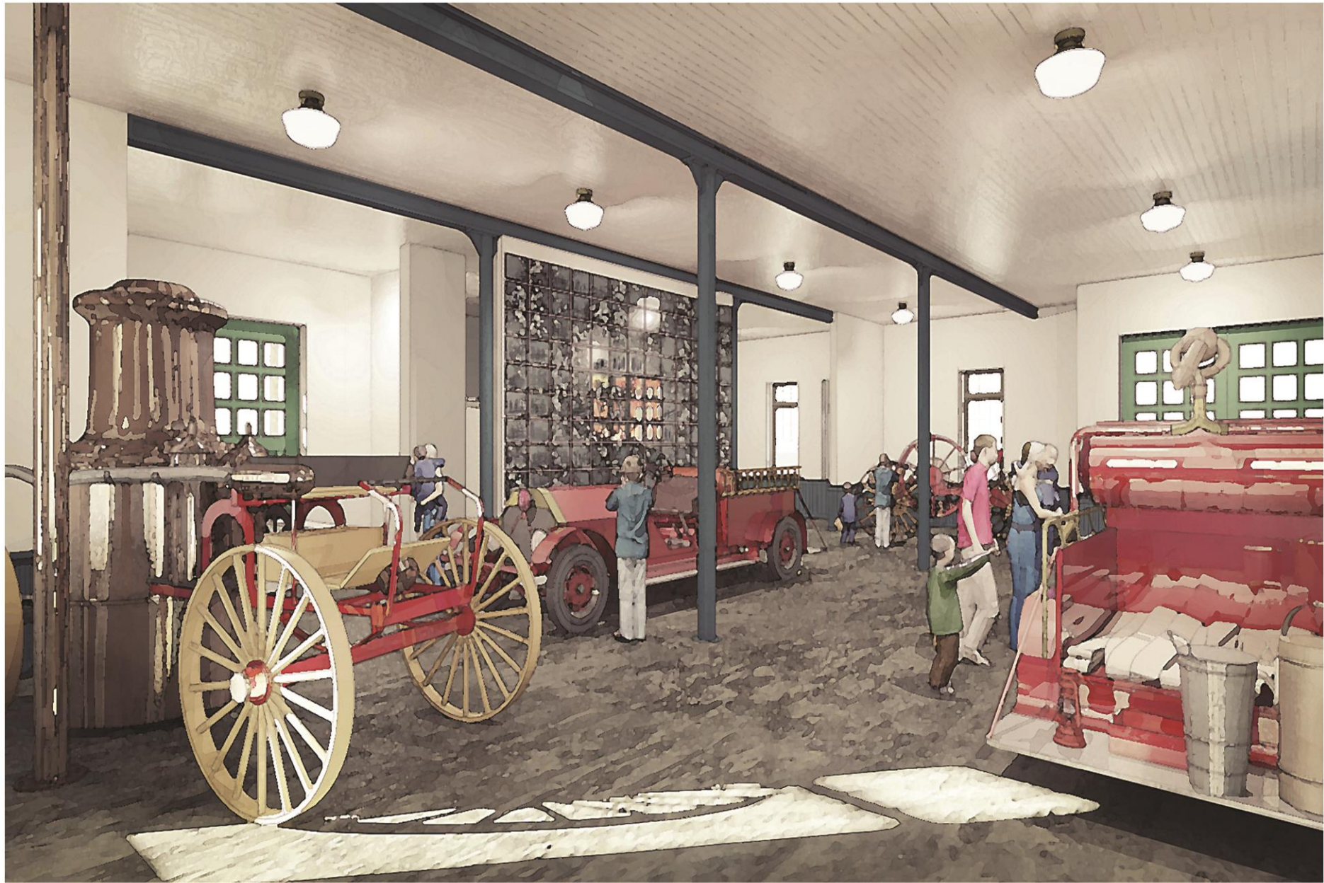
FIRST FLOOR VIEW RENOVATED EXHIBIT SPACE Dallas Firefighters Museum