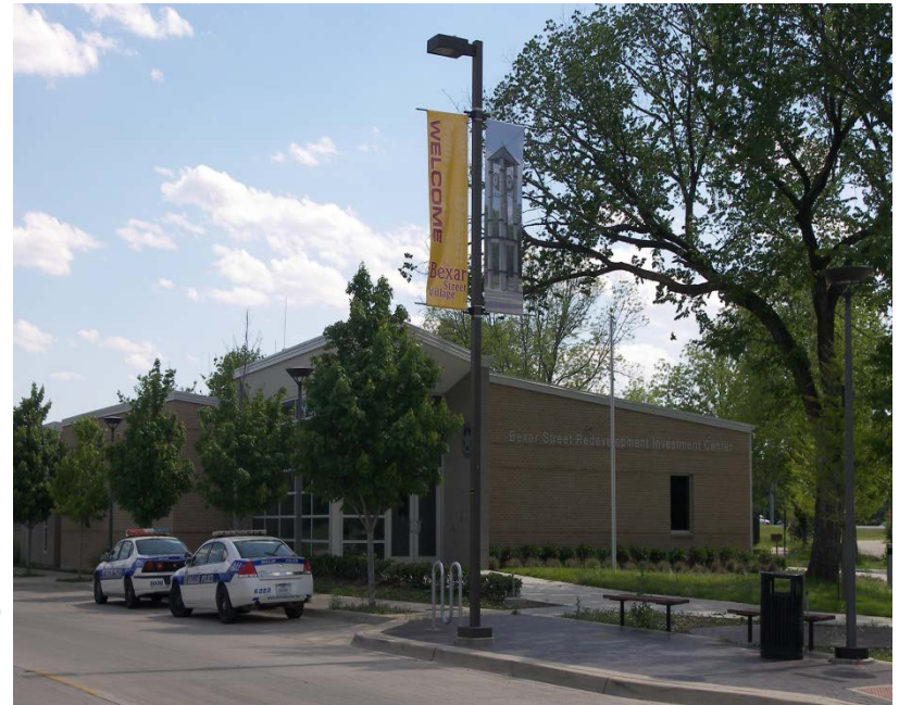
DPD Bexar Street Redevelopment Investment Center