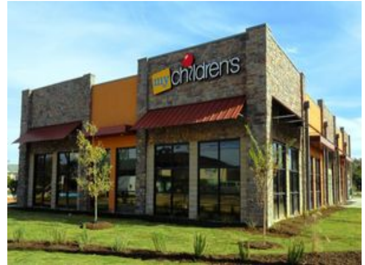
MyChildren's Mill City - 4922 Spring Ave.