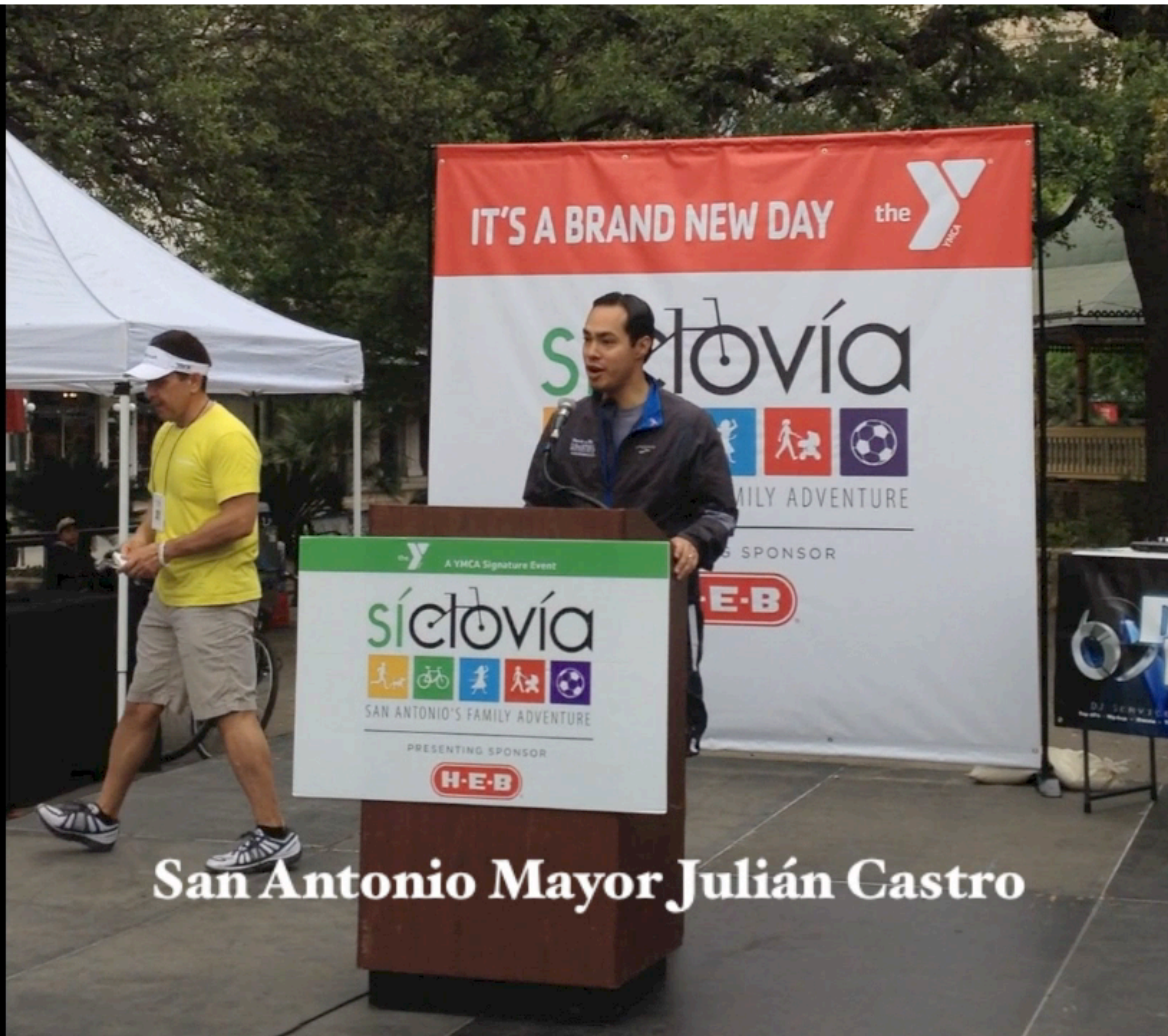
San Antonio Mayor Julián Castro