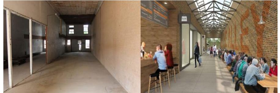
Before and after plans – (above) Mid-block cut-through and (below) streetscape and building improvements