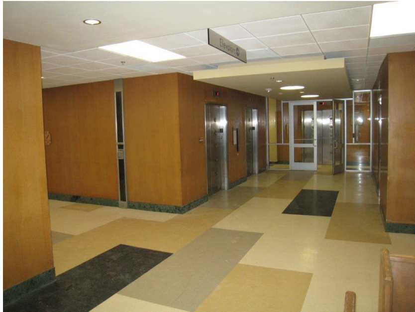
Upper Floor Lobby