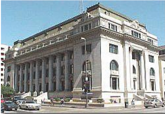
106 S. Harwood Street (Municipal Building)