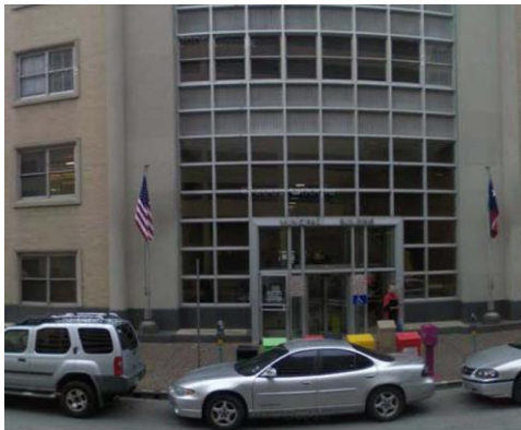
2014 Main Street (Municipal Building Annex)