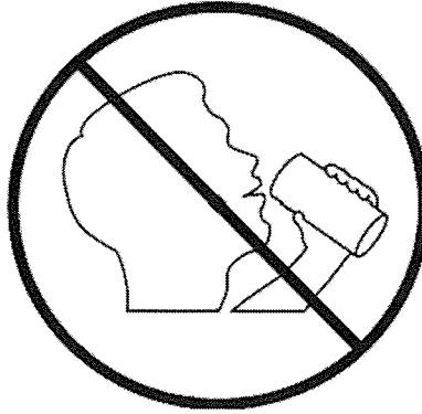
FIGURE 608.8.1 PICTOGRAPH—DO NOT DRINK

608.8.2 Distribution pipe labeling and marking. Nonpotable distribution piping shall be purple in color ( consistent with Pantone # 512 ) and shall be embossed, or integrally stamped or marked, with the words: “CAUTION: NONPOTABLE WATER – DO NOT DRINK” or the piping shall be installed with a purple identification tape or wrap ( consistent with Pantone # 512 ). Pipe identification shall include the contents of the piping system and an arrow indicating the direction of flow. Hazardous piping systems shall also contain information addressing the nature of the hazard. Pipe identification shall be permanently installed and repeated at intervals not exceeding 20 [25] feet (6096 [7620] mm) and at each point where the piping passes through or over a wall, floor or roof. Lettering shall be readily observable within the room or space where the piping is located.