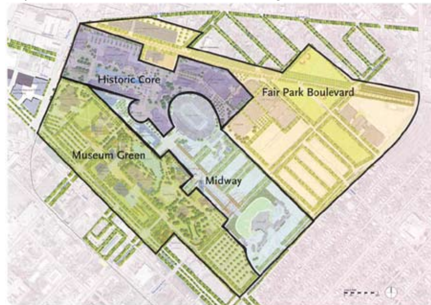
Map II-7.3 Area Plan for the Fair Park Neighborhood

This map of an Area Plan for the Fair Park neighborhood provides a good example of consensus-driven planning.