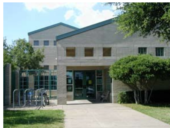
With regular access to students through their developmental years, schools are a great community resource for conducting early crime prevention.