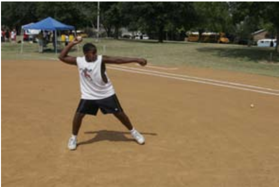
Access to parks, playgrounds, ball fields, natural areas, transit service, commercial districts and other civic amenities should be available within walking distance of all neighborhoods.