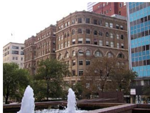
Protection of historic buildings such as the Wilson Building, patterned after Paris' Grand Opera House, helps Dallas retain a connection to the past.

7.1.6.7 Make sure all planning at the neighborhood level addresses the critical and growing need for affordable housing.