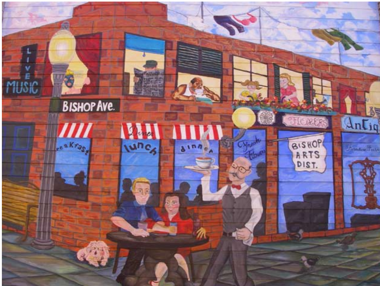
The Bishop Arts District mural adds color and character and helps define the areas's sense of place.