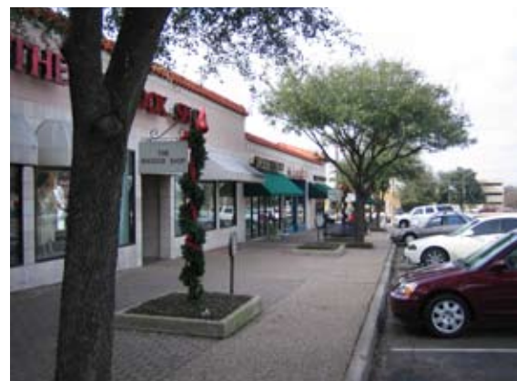
Neighborhood-serving retail adds to the walkability and quality of life in a neighborhood.