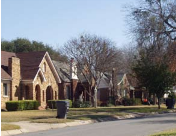
Residents value the historic character of Dallas' many unique and charming neighborhoods.