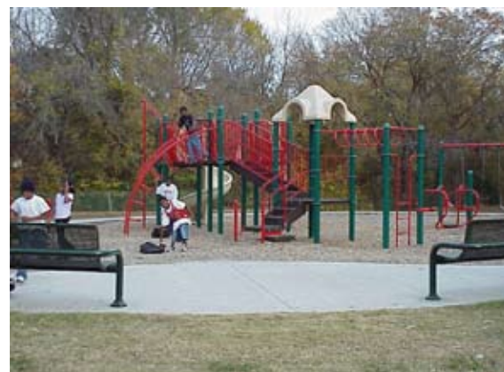
Neighborhood parks provide family recreation areas close to home.