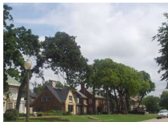
Historic neighborhoods like South Boulevard Park Row help provide a strong sense of community identity.