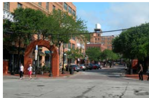
Historic districts, such as the West End Historic District assure that the city's most significant historic neighborhoods will stay intact over the long term.