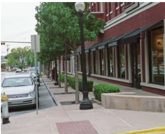
Dallas is a city of neighborhoods. Dallas residents want to see their neighborhoods become more pedestrian-friendly, treed and better connected to area employment, retail and civic destinations.

In surveys, Dallas residents say what they want to change most in the city is its appearance—they want it to look beautiful, with trees and pedestrian-friendly neighborhoods. The quality of life of a community is reflected by the quality of its neighborhoods. Stable, well-planned and connected neighborhoods are critical to the city's economic health. ForwardDallas! recognizes that it is imperative to maintain, stabilize and revitalize existing neighborhoods. Encouraging the creation of new neighborhoods that are safe, pedestrian-friendly and provide diverse housing opportunities is one of the City's key economic development priorities.