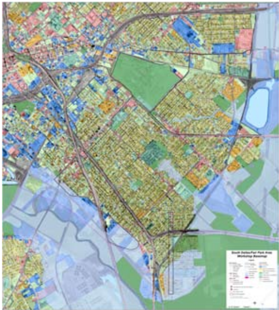
Map II-7.2 South Dallas Base Map