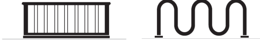
Figure GHI - "Grid"-style and "Wave"-style racks are not permitted.