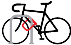
Figure DEF - A single U-lock securing both a wheel and the bicycle frame.