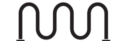
Figure XYZ - Examples of permitted racks.